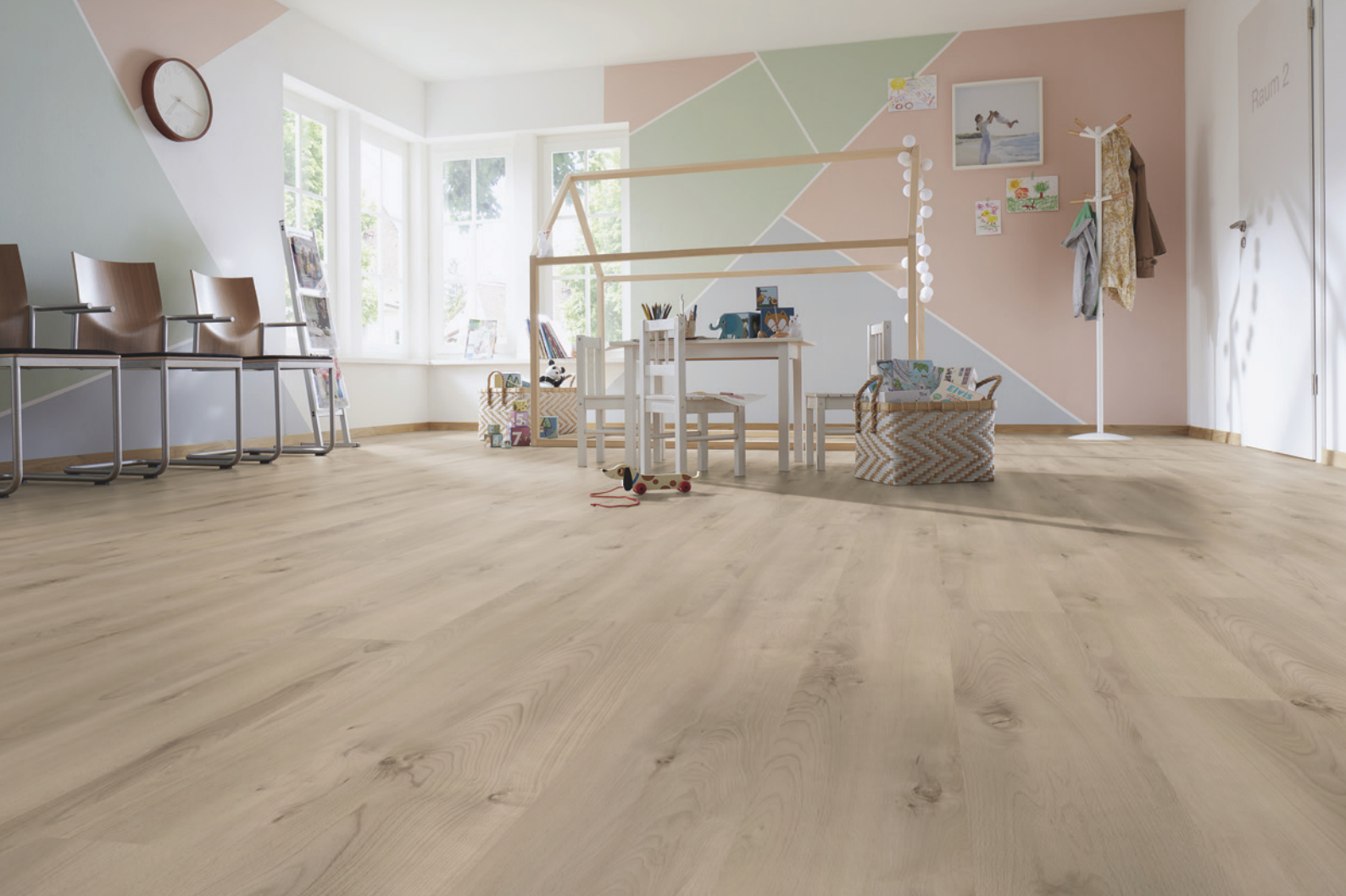
Lorine Light - D4991