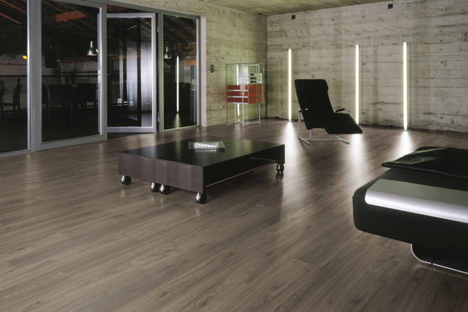
Walnut Palazzo - D4757