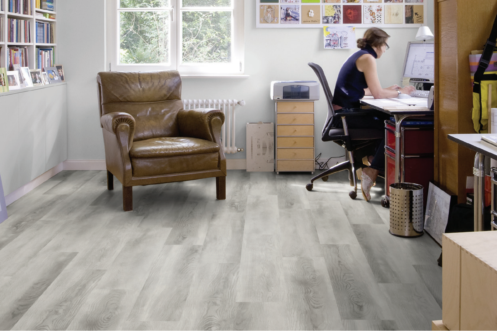
Barrow Oak - D4781