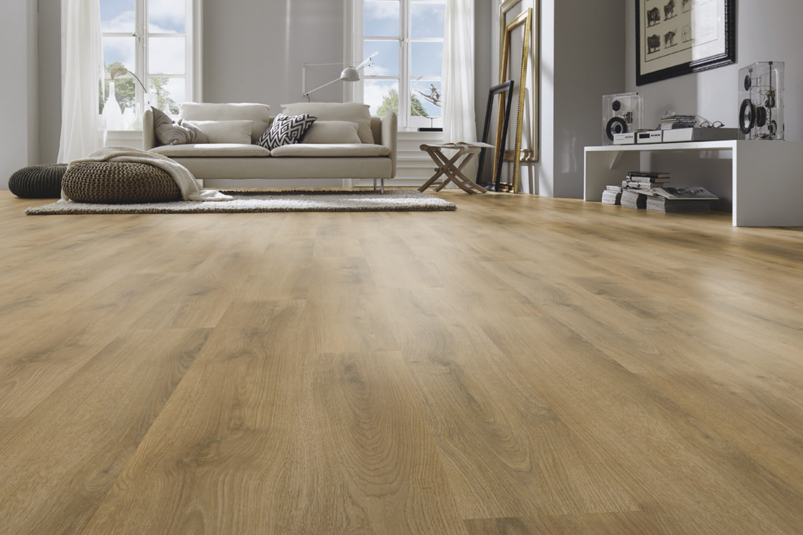
Elbe Oak - D3901