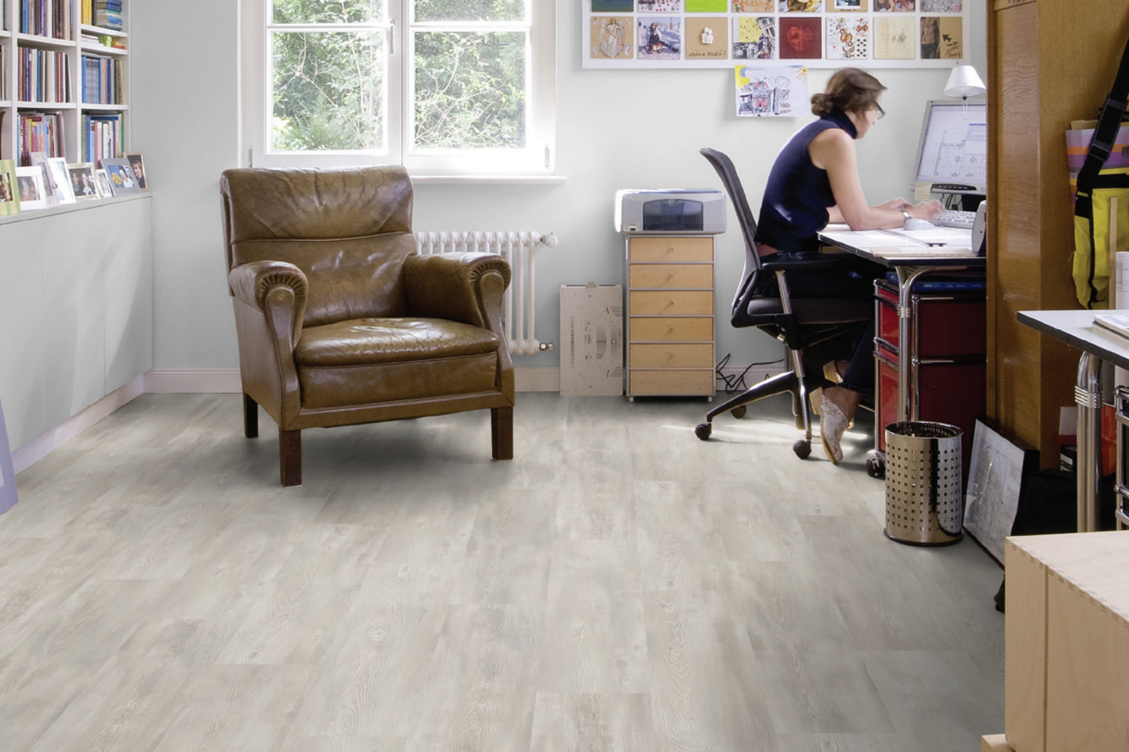
Nevada Pine - D4127