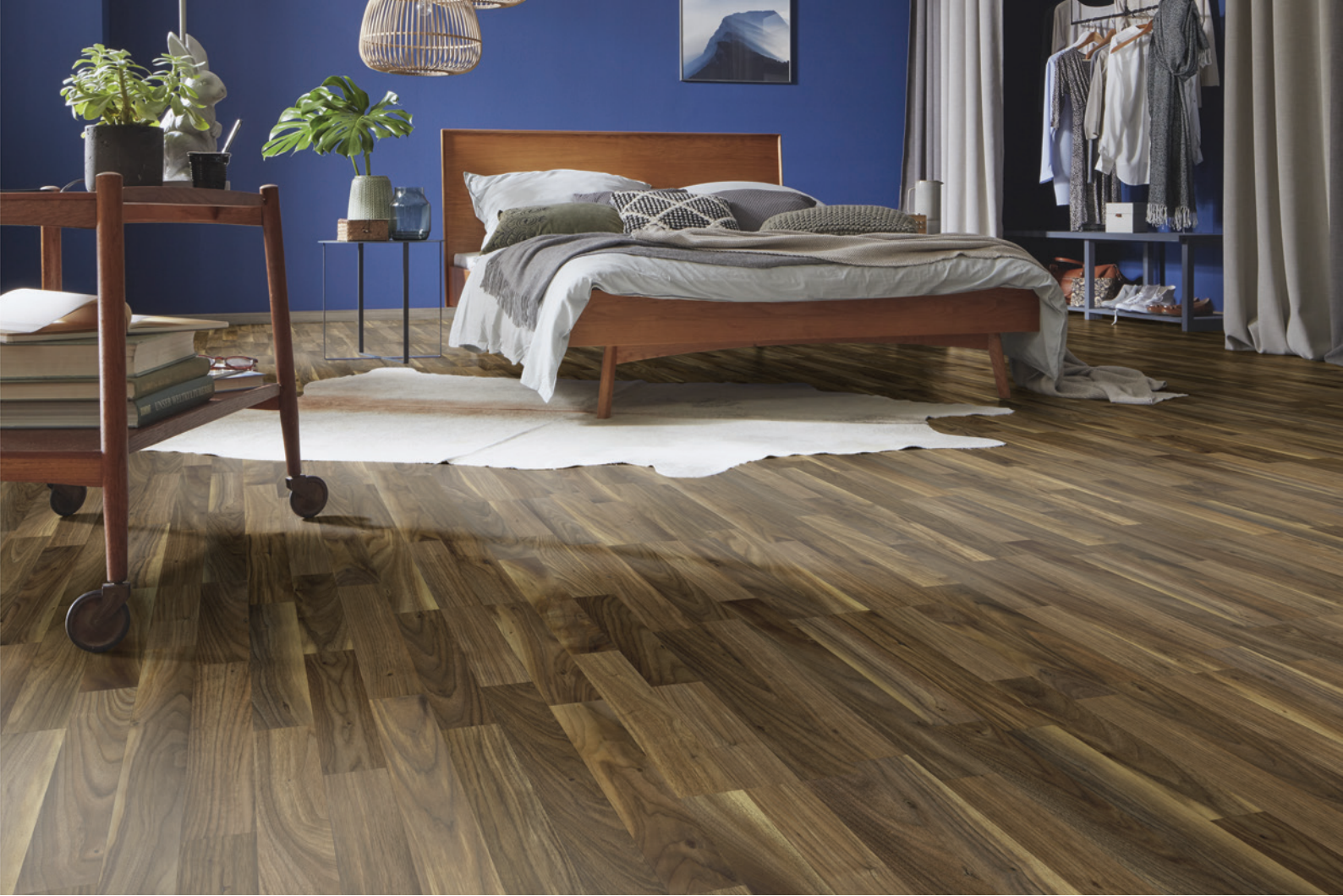
Walnut Historia - D4773